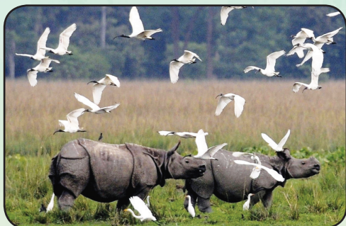
View of Kaziranga National Park