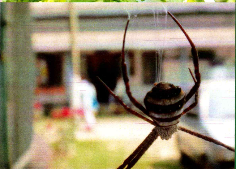
Some of the Animal of Nowgong College Campus